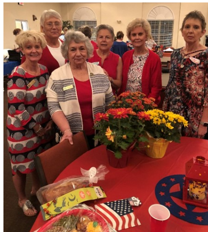
Oconee County Pilots attended the Monroe Pilot Club Picnic.