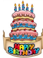
Debbie Wagner: April 13