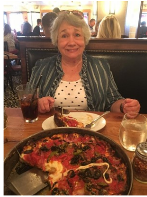
Chicago style pizza...mama Mia!!!