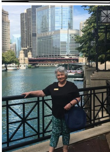
Outside the Chicago Sheraton on the River Walk.