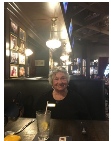
At Harry Caray's Tavern on the Navy Pier.