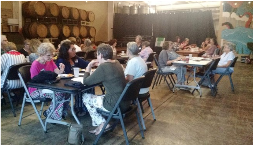
Oconee Pilots visiting with guests.

1 st Annual “Dames & Games” night on September 17 th was a success. The Membership Division appreciates everyone’s attendance, enthusiasm, and for bringing guests. We have received great feedback from our guests and look forward to many of them joining our club in the near future. Dames & Games was an excellent representation of “Walking Together in Friendship and Service” by us sharing Pilot knowledge and having fun!