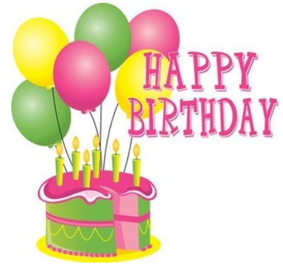
Sandra Glass March 25