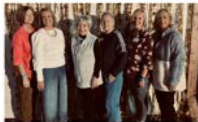
Silent Auction Hostess